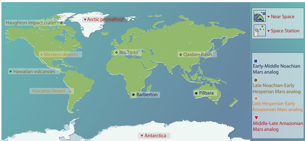
Figure 1. Global map of representative terrestrial Mars analogs in accordance with different Mars geological periods. Detailed information can be found in Table 1.